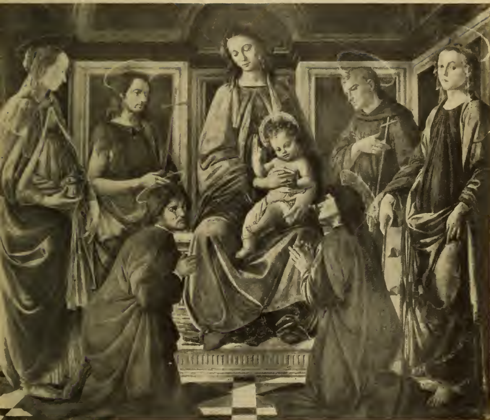
VIRGIN AND CHILD ENTHRONED, WITH SAINTS

FROM THE PAINTING BY BOTTICELLI IN THE ACCADEMIA